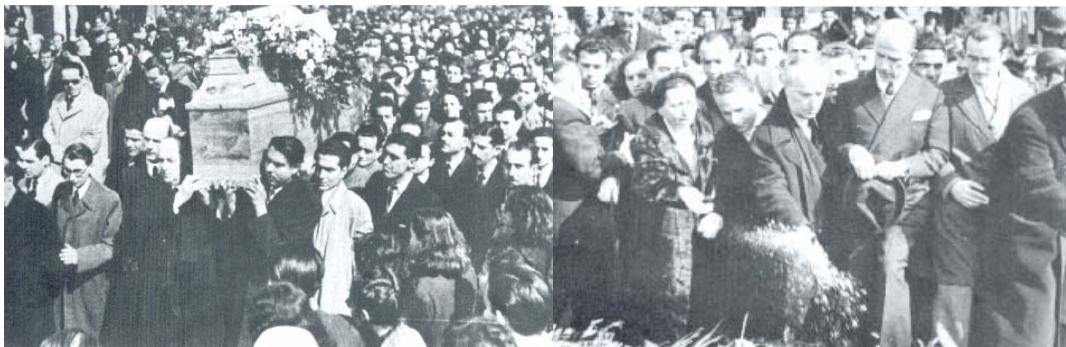
Sikelianos throwing the traditional handful of dust on the coffin of the National Poet lowered into the grave while tens of thousands of people came to see him off and demonstrate against the German occupation