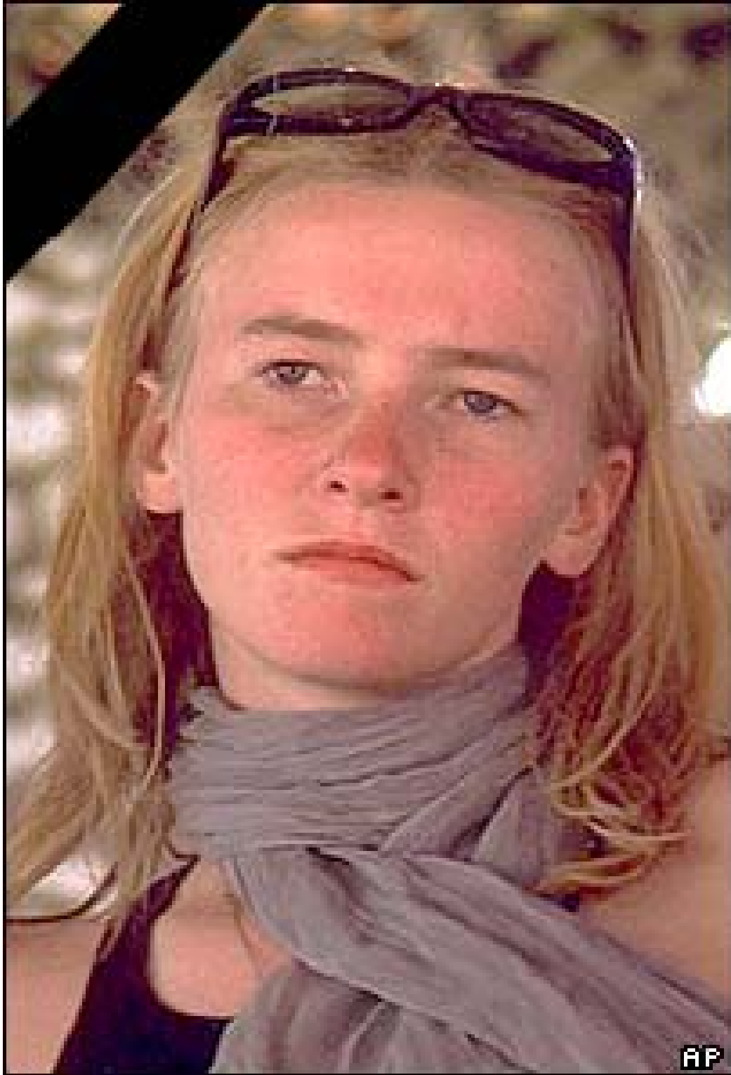
Held her ground for all humanity