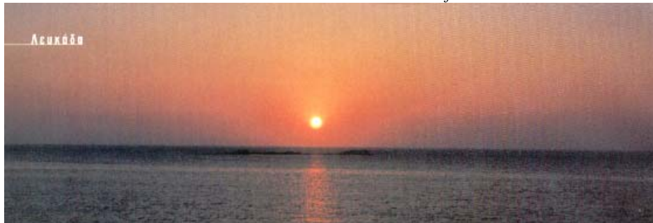
It's a thick-tailed meteor pulsing toward the archipelago.... A living river of shade, a comet of countless hearts eclipses the world's sun