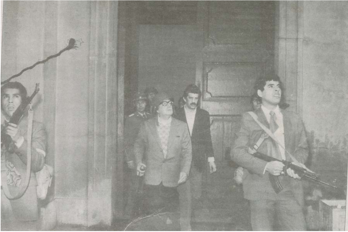
Come on, come my brothers, we're encircled by sun's fire, its fire's now closing upon us...